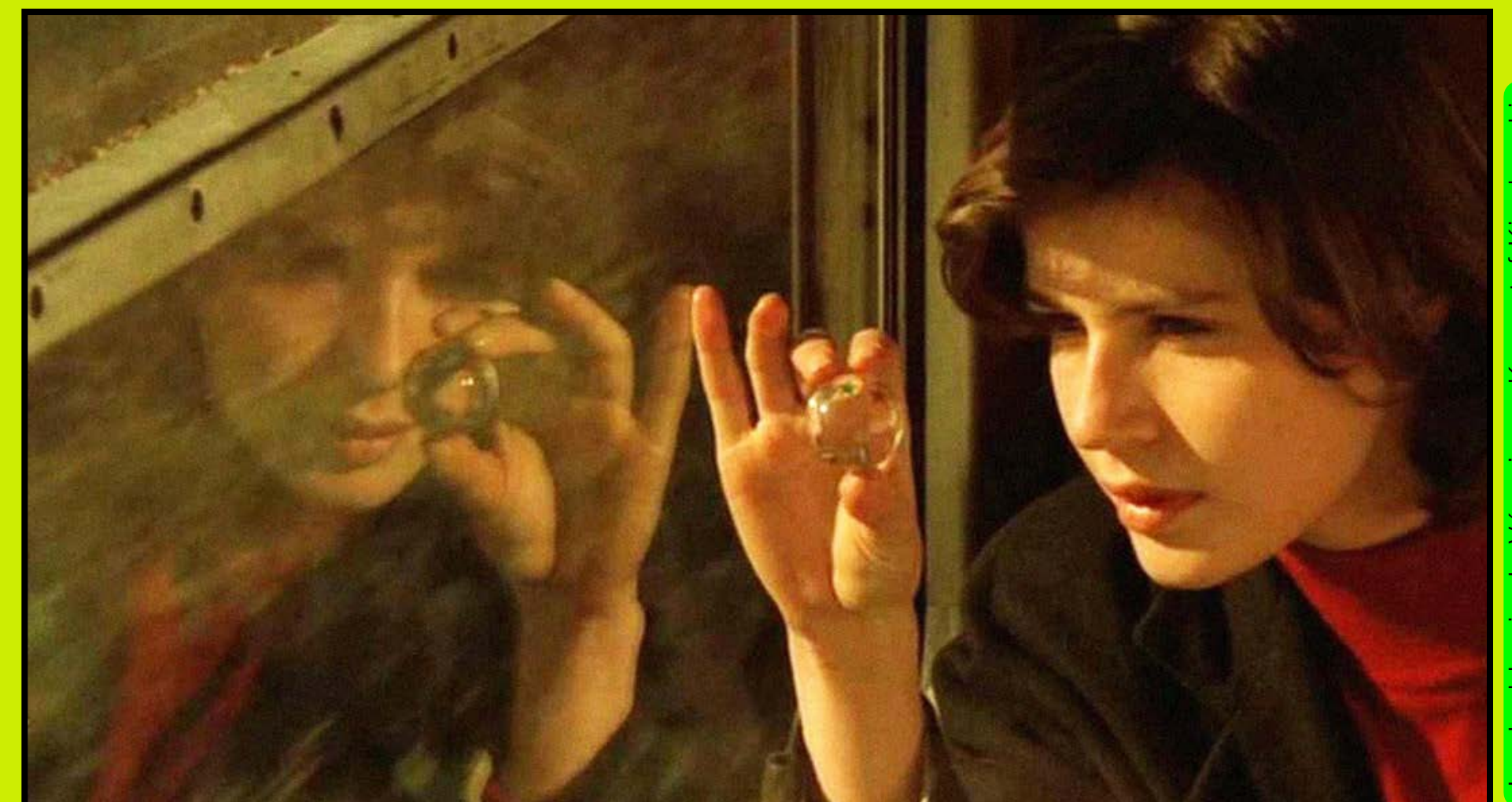
La double vie de Véronique. Krzysztof Kieslowski

This workshop is a walkthrough all these questions, with a special focus on short-film format. Aiming to enrich and sharpen each individual project of the participants in it's unique way, and to create a solid bass and vocabularies for the further developments ■