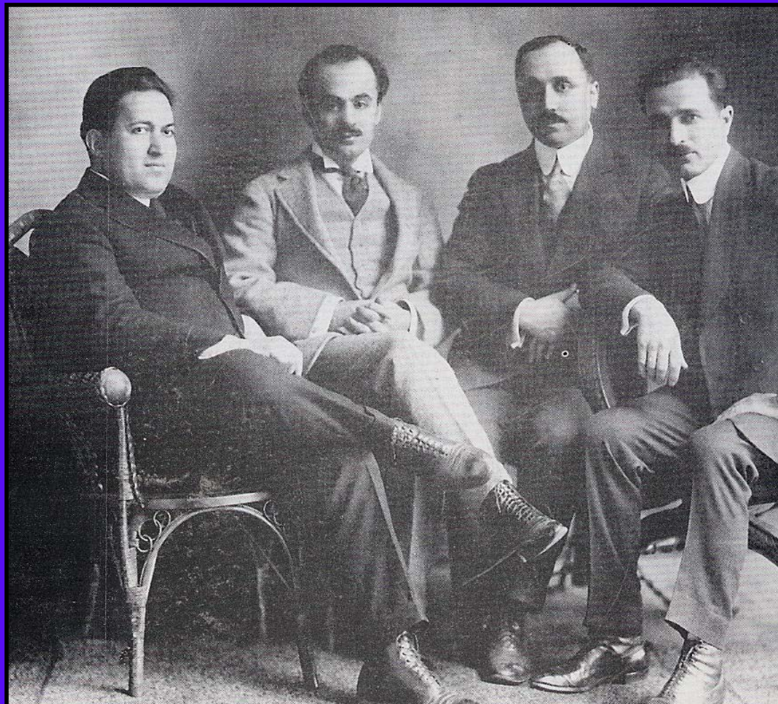
The Pen League

No software is required! Here all will be analog, and deeply personal ■